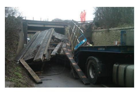
Bridge dislodged from abutments onto the vehicle which struck it