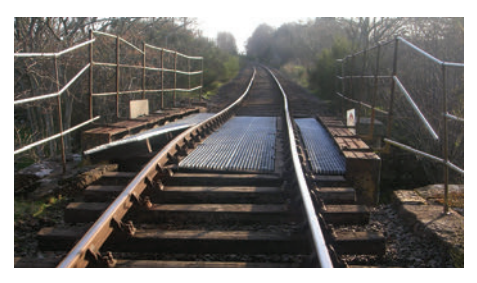
Track distortion due to a bridge strike

Bridge strikes may also occur at bridges over public roads carrying footpaths, canals, and other roads.