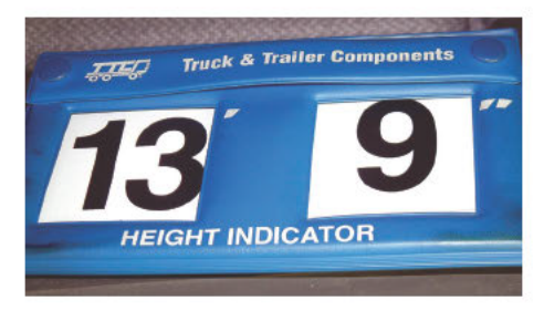
Notice in a driver's cab displaying the overall vehicle height

For most vehicles, The Road Vehicles (Construction and Use) Regulations 1986 SI No.1078 as amended requires the maximum height of the vehicle in feet and inches to be displayed on a notice in the cab of a vehicle when the overall travelling height is more than 3 metres.