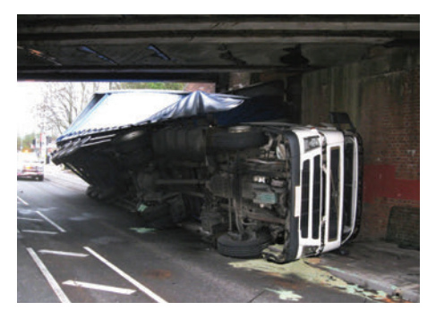
A curtain sided lorry overturned as a result of a bridge strike