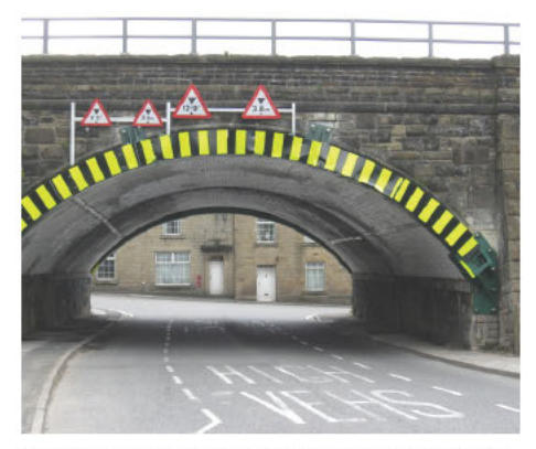
White lines on the road and 'goal posts' on the arch indicating the extent of the signed vehicle height limit

At arch bridges, white lines on the road and 'goal posts' on the bridge may be provided to indicate the extent of the signed limit on vehicle height, normally over a 3 metre width. There may be an additional set of 'goal posts' showing lower limits towards the kerb.