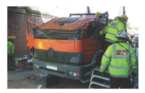
Crushed cab of a skip lorry following a bridge strike